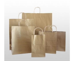
Paper Shopping Bags