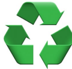
Recycling & Other "Green" Signs