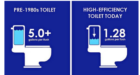
Low flow faucets and toilets