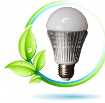
LED light bulbs