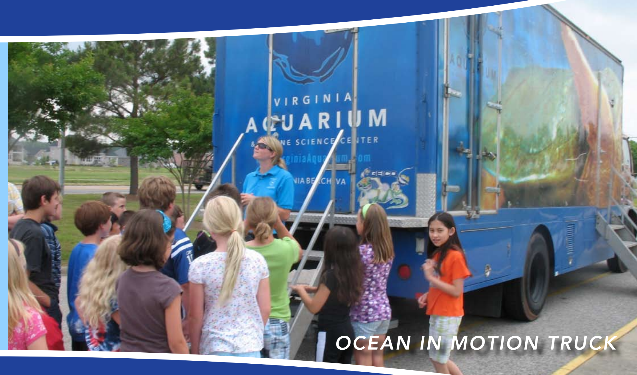
OCEAN IN MOTION TRUCK

More than 443,000 adults and children participated in Aquarium education programs during fiscal 2010, including 32,000 at onsite and Ocean in Motion traveling truck events; 700 at Bay Lab on the shores of the Chesapeake Bay; 1,500 Boy and Girl Scouts; 62,000 on boat trips; and 3,300 Access Aquarium students from Title I schools.